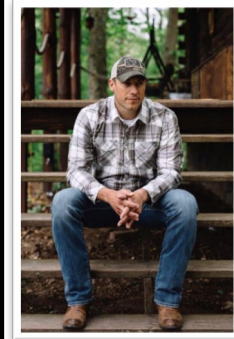
12-8pm Hickory Ridge Log School Opens